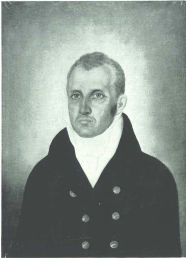
CAPTAIN CORNELIUS SOULE

Portrait painted at Canton, China, ca. 1813.