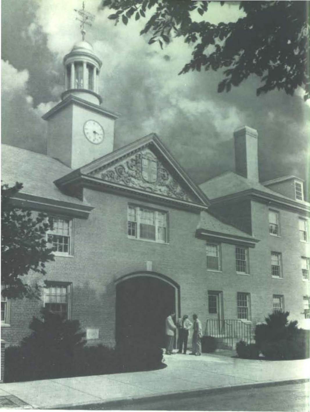
THE CINCINNATI GATE OF THE WRISTON QUADRANGLE, 1950 (Given by the Alumni of Cincinnati, Ohio)

ening trouble. His "eyes were in every place, and his authority was as irresistible as an Alpine glacier." 21 During difficult periods, "every part of the buildings was subject at all hours to his visits." 22 When serious offenders were apprehended, he dealt with them as quietly as possible. Sometimes he was satisfied after an interview that the culprit would reform; occasionally he concluded that a student must be dismissed, which he did inconspicuously. 23 In these techniques he imitated Eliphalet Nott.