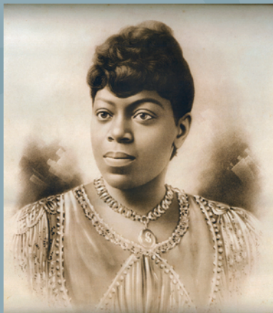
Portrait of African American opera singer Matilda Sissieretta (Joyner) Jones

She was often given the title "Black Patti" in reference to Italian soprano Adelina Patti.