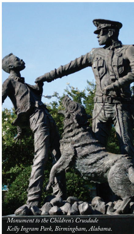
Monument to the Children's Crusade Kelly Ingram Park, Birmingham, Alabama.

School was out for the summer, right? Well, not if you were a history teacher in East Providence, Cranston or Cumberland. For the last three years, teachers from these three districts have been participating in a Teaching American History grant directed by the Rhode Island Historical Society. This summer, working with the American Revolutions Collaborative, our teachers headed down South to better understand the complexity of the American Civil Rights Movement—a revolution in its own right.