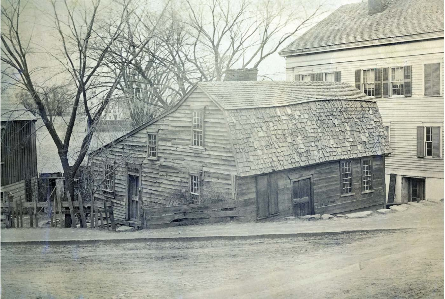
[William Caesar's House], c.1880, RIHS Collections, RHIX17158

The following document is a photograph of a house taken in 1880.