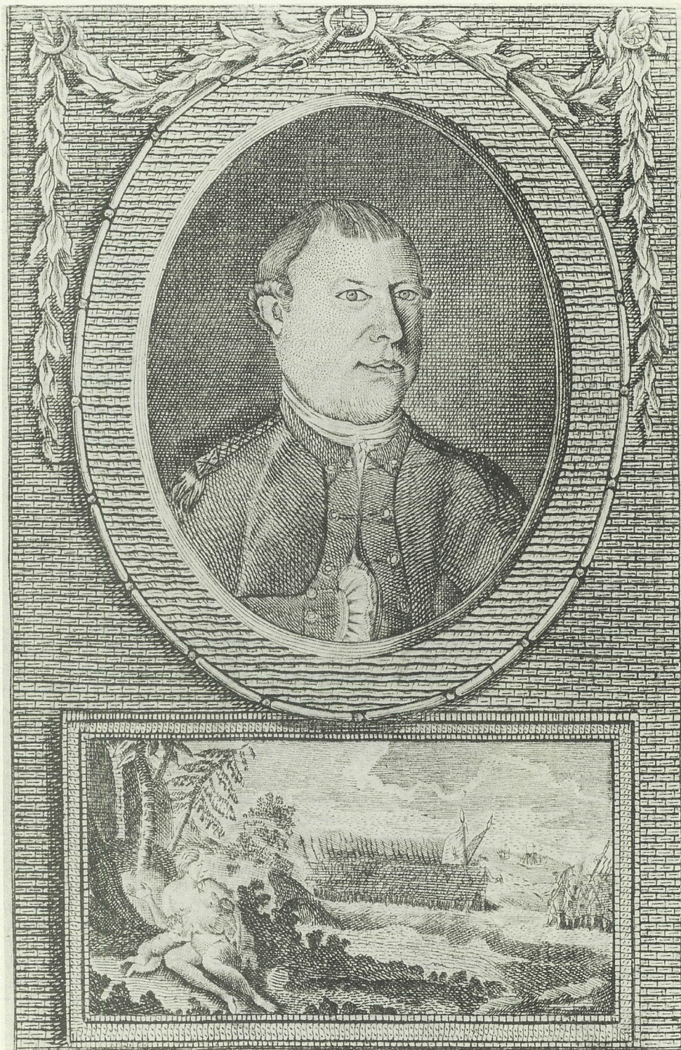
His Ex ty NATHANIEL GREEN Esq; — MAJOR GENERAL of the AMERICAN ARMY