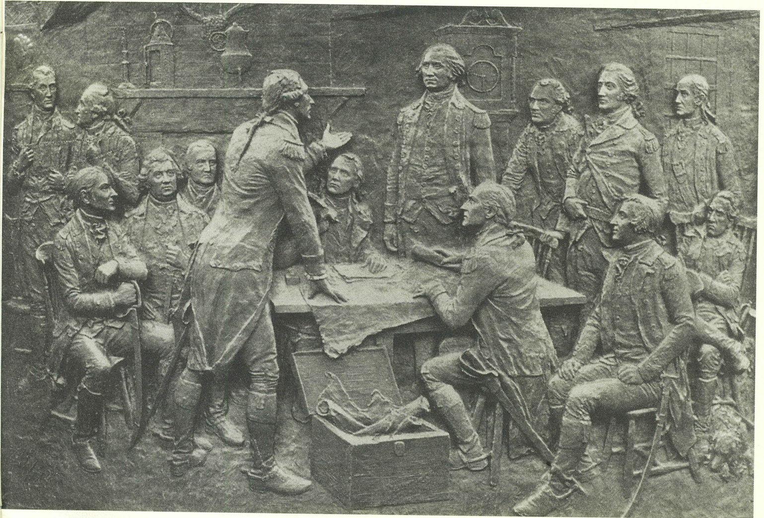
George Washington (standing, center rear) presides over a meeting of his generals in this anonymous bronze relief. Nathanael Greene is seated in the foreground at the extreme right.

I am informed that the word Administration in your Letter of Resignation was so highly offensive to Congress, that some of the worthy members immediately on the Letter being Read moved the House instantly to disrobe you of all Military Rank, at the same time that they accepted of your Resignation as Quarter Master General. Others more moderate, tho not at bottom more friendly, objected to a measure so violent, but at the same time proposed that Congress should immediately desire the Commander in Chief to signify to you that your future