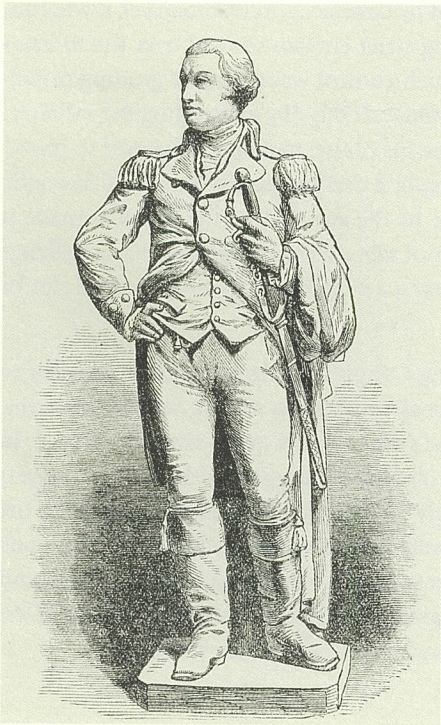
Henry Kirke Brown’s marble statue of Nathanael Greene, presented to the United States by the State of Rhode Island in 1870, stands in the east central hall of the United States Capitol.